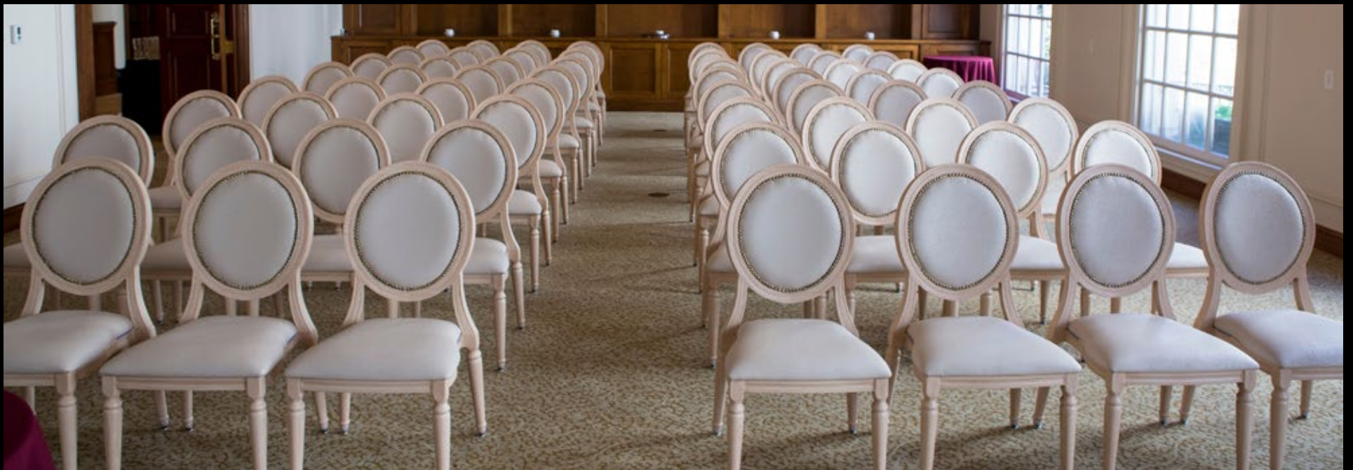
LANISTER UPHOLSTERED CHAIR