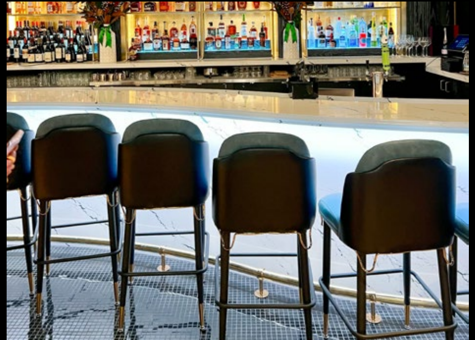
CORAL CHAIR & ESCAPE BAR STOOL