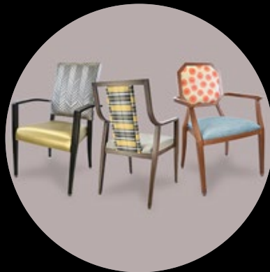
COUNTRY CLUB CHAIRS