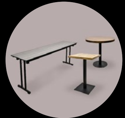
BANQUET & RESTAURANT TABLES