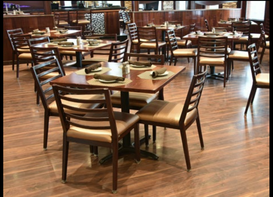
ALLAN CHAIR & BAR STOOL