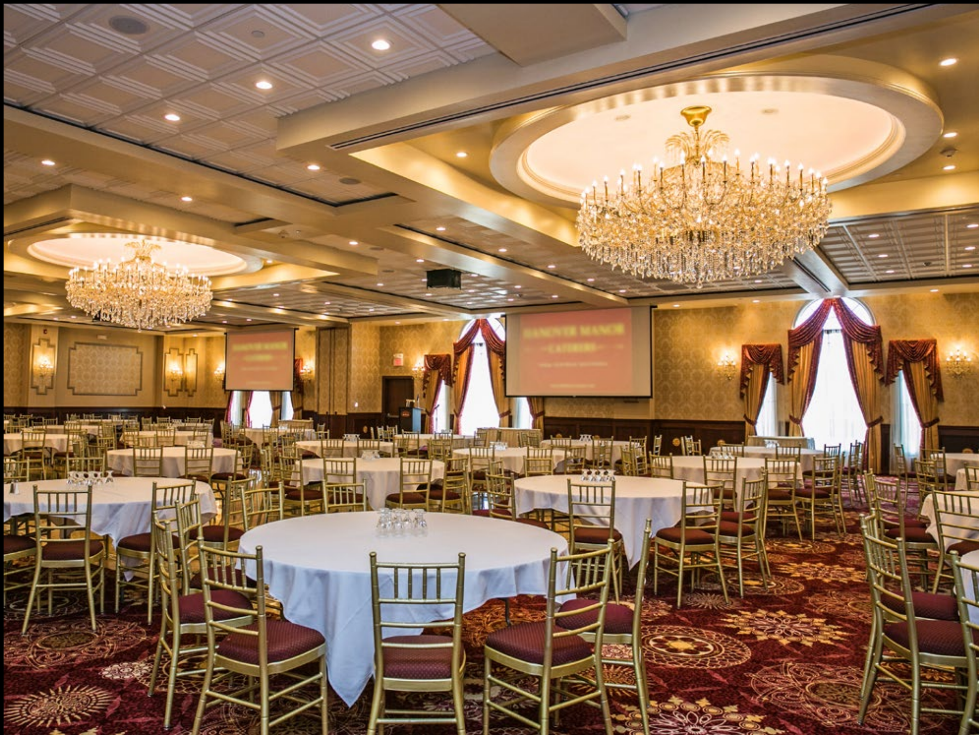
CHIAVARI CLASSIC CHAIR