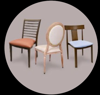
RESTAURANT & FINE DINIG CHAIRS