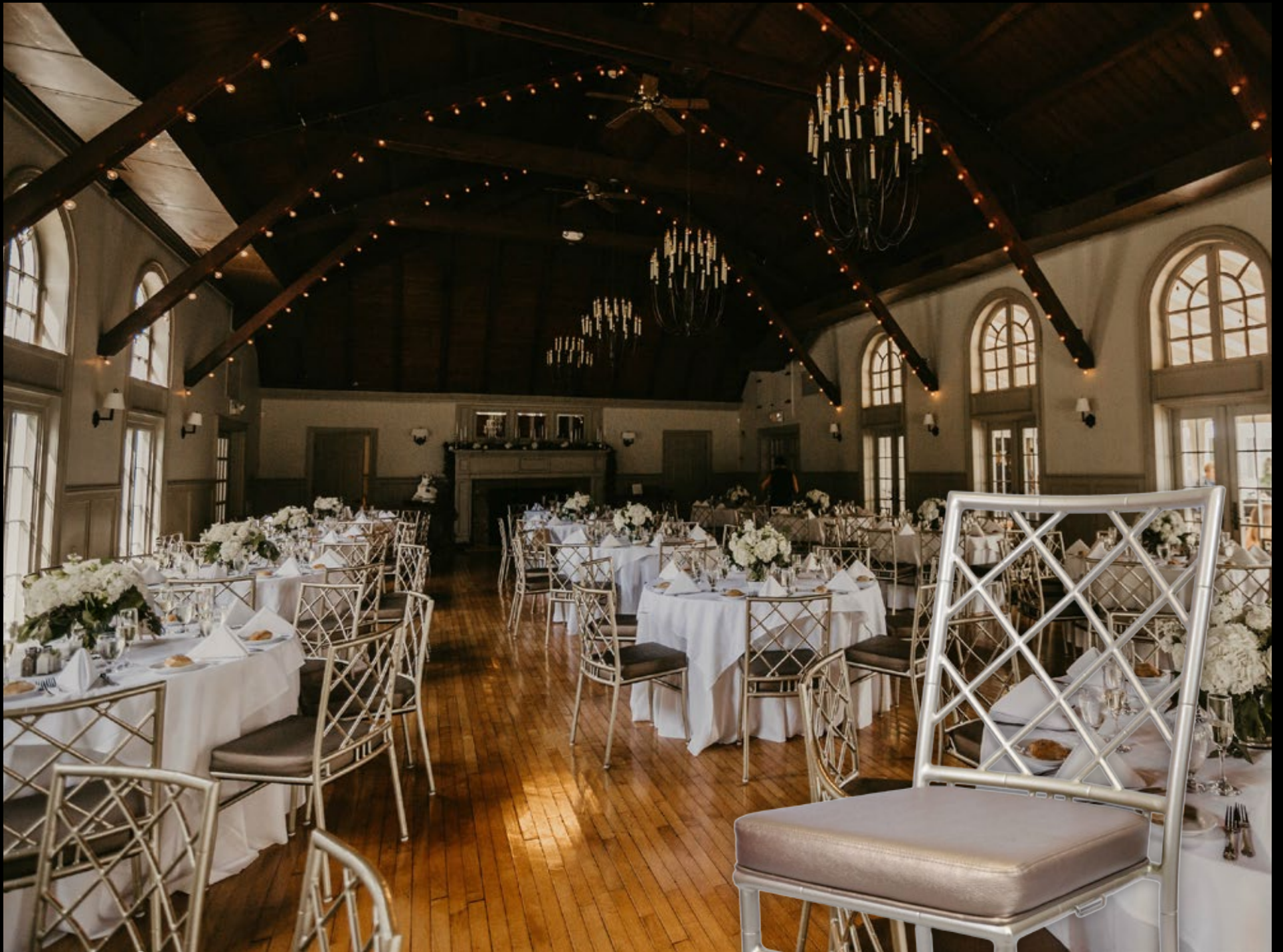
CHIAVARI DIAMOND CHAIR