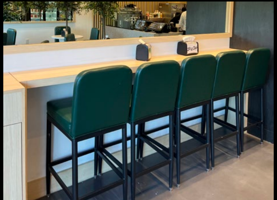
PARIGI CHAIR & BAR STOOL