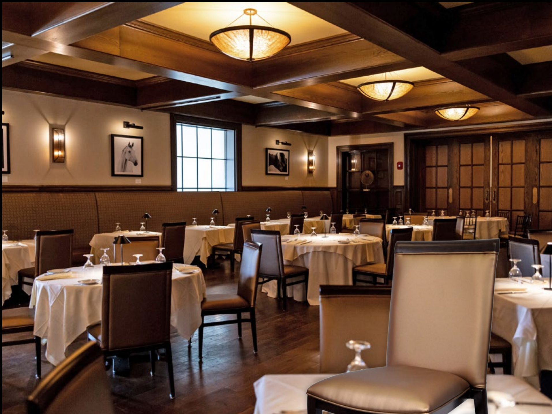
BARATHEON S CHAIR