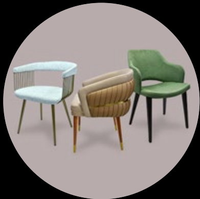
LOUNGE & LOBBY CHAIRS