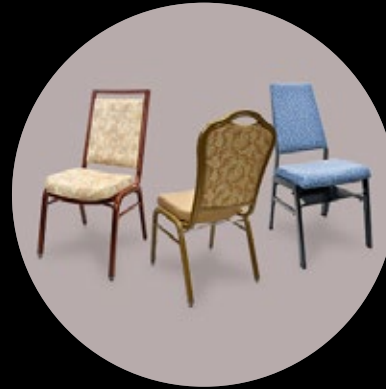
CONFERENCE & SANCTUARY CHAIRS