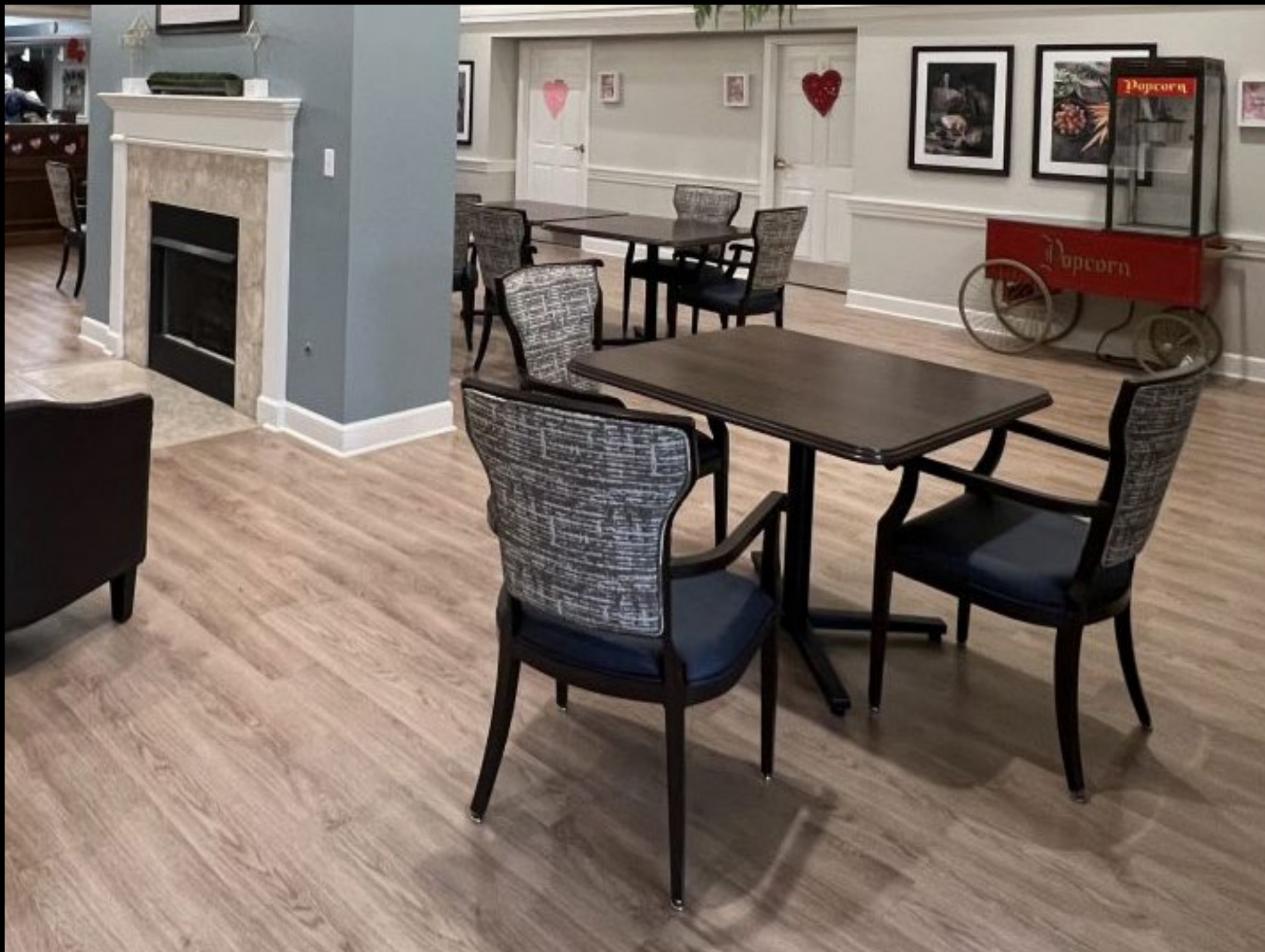
TORINO ARM CHAIR