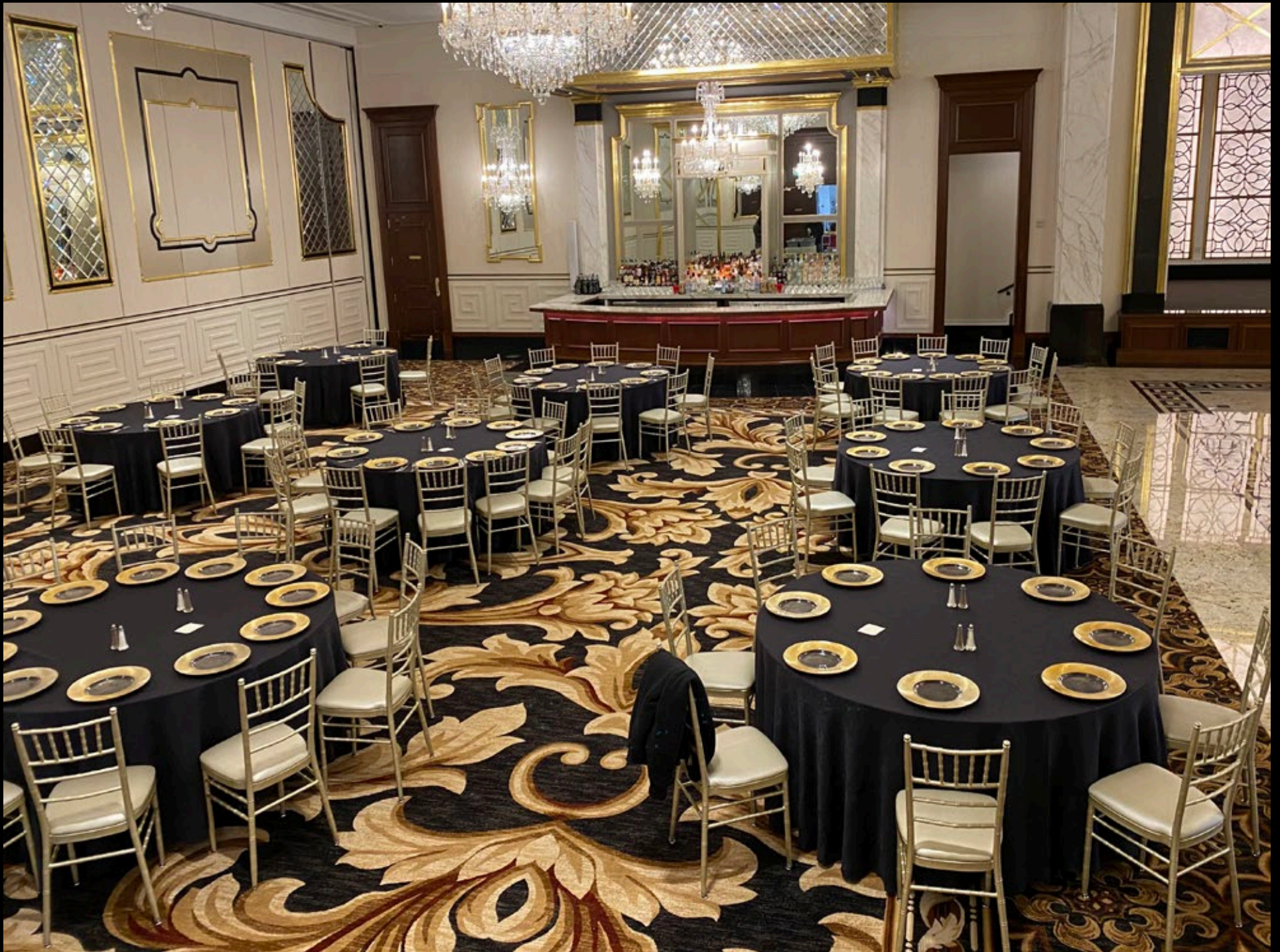
CHIAVARI CLASSIC CHAIR