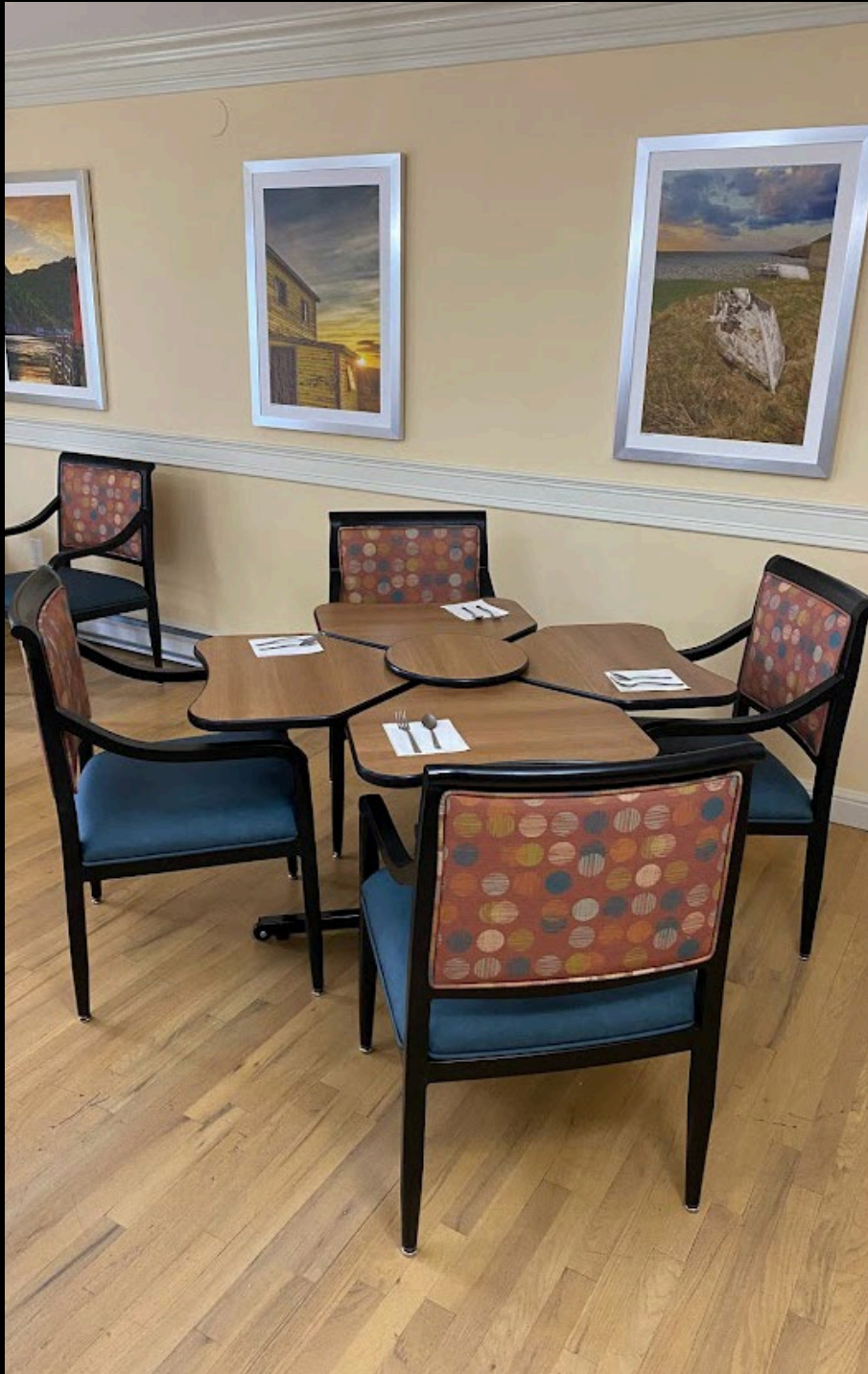
FAUSTO ARM CHAIR