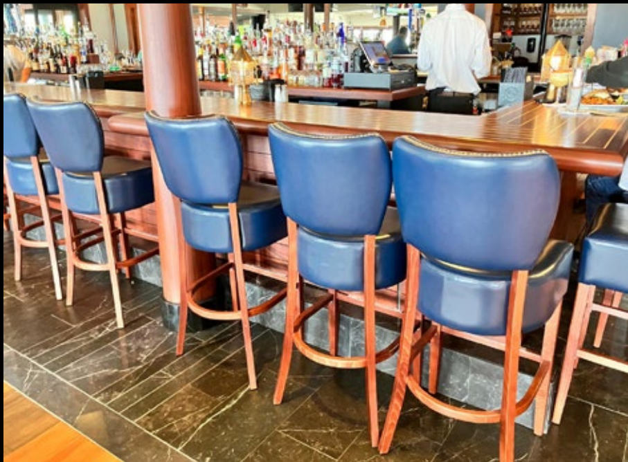
STOKE GRAND II CHAIR & BAR STOOL